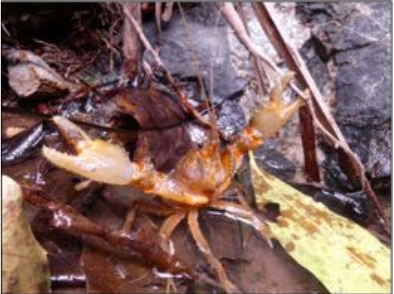
Euastacus setosus (Mt Glorious Spiny Crayfish) – IUCN “red listed species” at Mt Glorious

Building on many years of voluntary work by the communities of Mt Glorious and Mt Nebo, and the Mt Nebo and Mt Glorious Environment Protection Association (MEPA) in particular over the last five years, a successful partnership has been built to promote a more coordinated management system for the area's road and power corridors, public lands and private properties.