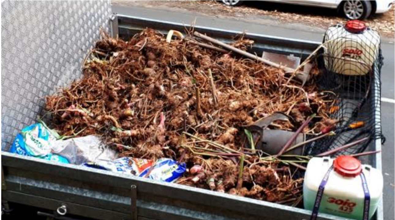
Kahili Ginger rhizomes – dug out, Mount Glorious

This report was produced with information supplied by and with the assistance of MEPA office bearers, MEPA volunteers & weed contractors. QPWS is ever-helpful in a number of ways, facilitating access to Park areas and sharing important on-ground information to assist in optimising outcomes in respect of weed control.