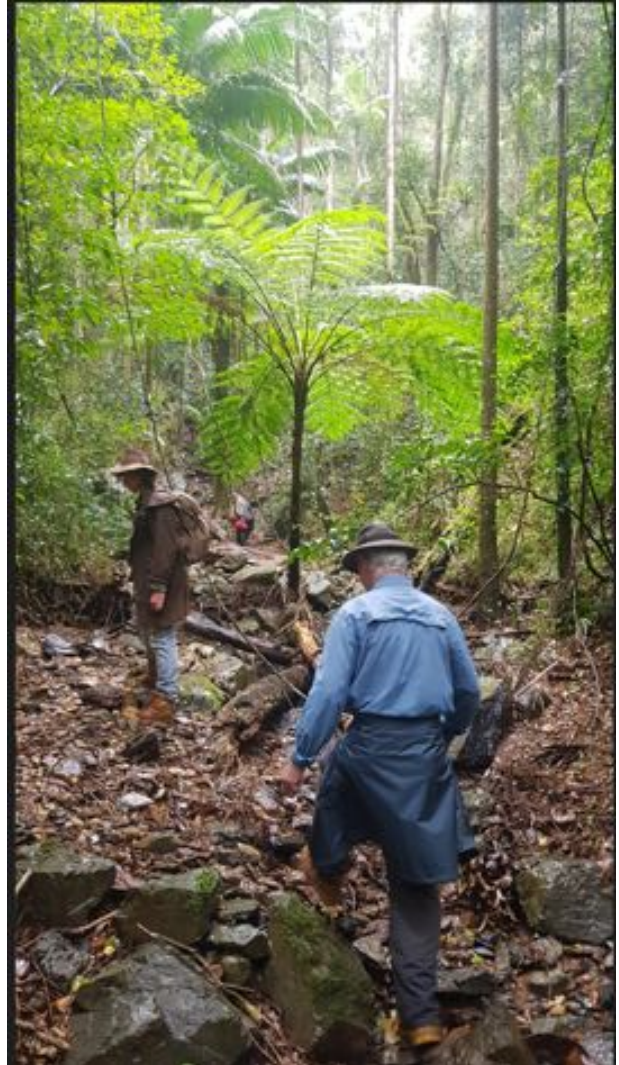
E. setosus burrow (L) and State-funded surveying of the steep creeklines (R) at Mount Glorious